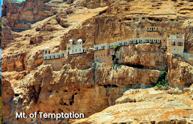
Mt. of Temptation