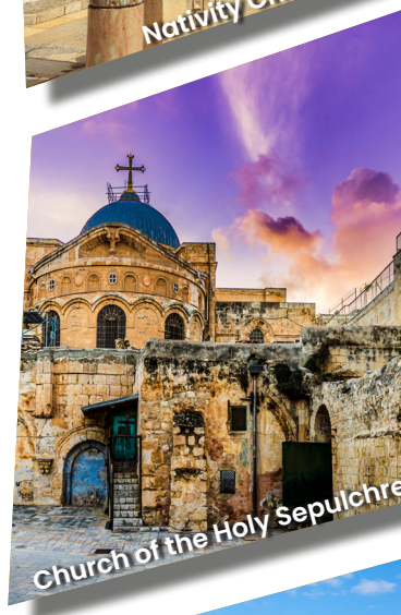
Church of the Holy Sepulchre