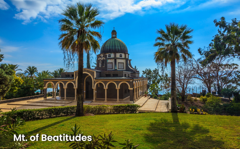
Mt. of Beatitudes